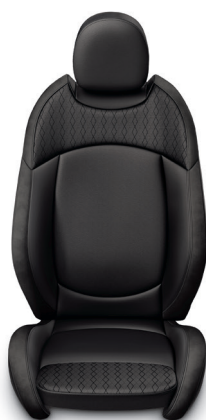
Sports seat Leather Cross Punch 2 Carbon Black