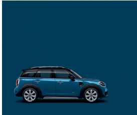
Island Blue 2