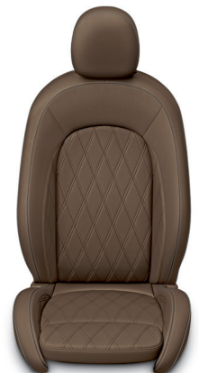
Sports seat Leather Chester 2 British Oak