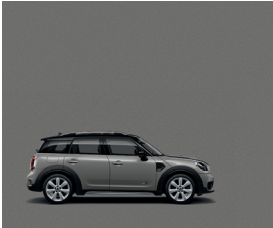
Standard colour Moonwalk Grey 2

Colour makes the world a brighter place and says something about us as a person. You can choose from 10 eye-catching paint colours to give your Countryman a personal touch and stand out wherever you go. The three contrast colours for the roof and mirror caps provide scope for an even more personalised look. The light-alloy wheels are available in 12 different designs, ranging in size from 16" to 19". A selection of nine of these are shown to the right.