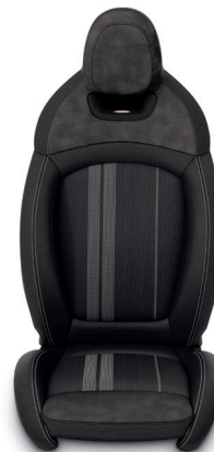
John Cooper Works sports seat Dinamica/cloth combination Carbon Black