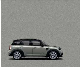
Melting Silver 2