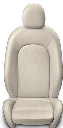
Sports seat Leather Chester 2 Satellite Grey