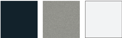
Roof and mirror cap colours: 1 Jet Black, Melting Silver or Aspen White