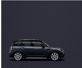
Thunder Grey 2/3