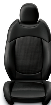
Sports seat Leatherette Carbon Black