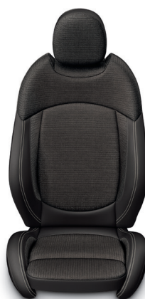
Sports seat Cloth/leatherette combination Black Pearl Carbon Black