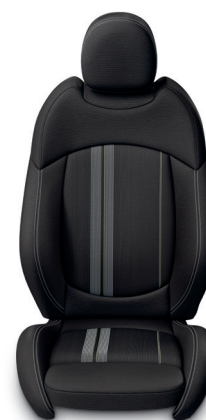
Cooper S standard sports seat Double Stripe cloth Carbon Black