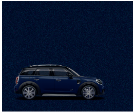
Special colour MINI Yours Enigmatic Black 2