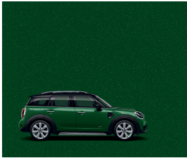
British Racing Green 2