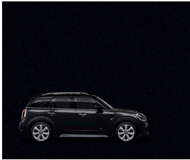
Midnight Black 2