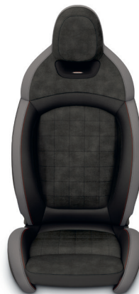
John Cooper Works sports seat Dinamica/leather finish Carbon Black

MINI YOURS. Experience the luxury feel of the MINI Yours leather Lounge Carbon Black seat, with its classic Union Jack design on the front of the headrest, its striking piping and its immaculate workmanship. In a MINI Yours seat, you can really feel the difference, however long the drive. 1